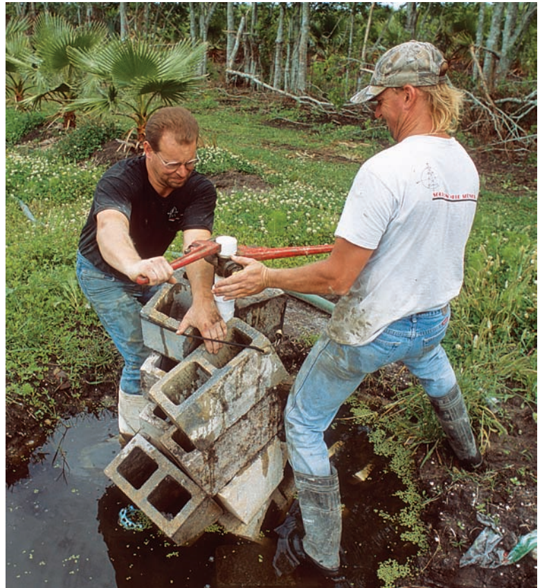
Table 3. Inventory of wells under investigation to be permanently abandoned, as of September 30, 2001

SUMMARY The program is responsible for plugging a substantial number of wells each year. At the same time, significant numbers of new abandoned artesian wells continue to be reported. Two factors contribute to the increase in abandoned wells: Florida's pattern of rapidly changing land use, and water well obsolescence. Water well obsolescence typically results from the corrosion of metallic well casings. Both factors can be expected to continue in the foreseeable future, making it likely that SJRWMD will continue programs to control abandoned wells.